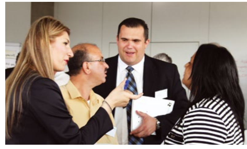
Participants of the dialogue event in one of many interactive sessions in Würzburg

The good practices are brought in by the practitioners from their immediate professional or work environment and are structured along key questions: basic issue, institutional background, approach, conclusion and transferability. The idea is to deliver insights into practical action for a local or regional context.