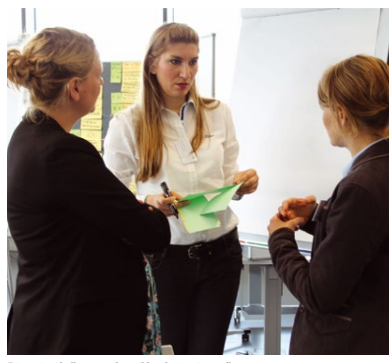
Discussing challenges and possible solutions in small groups

Another peer group discussed means to raise awareness for climate protection in traffic vis-a-vis the dominance of cars, which are still regarded as status symbols. Peers' ideas included the importance of addressing and changing mind-sets; focus on changing the status symbol promoting cycling as a modern way of living; and once again: make cycling sexy.