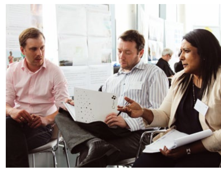
Discussion among participants in working groups

Energy efficiency can help to meet rising energy demands of the growing population. But in general there is a low level of awareness of the importance of energy efficiency in the administration and among the people in general - though there are very positive responses on