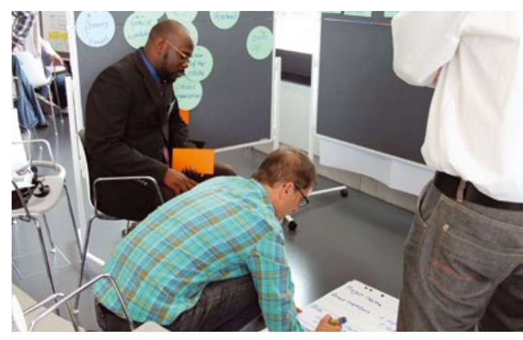
Representatives of Portmore and Hagen working together during the event

The six hectare Climate Change park is planned to be a recreation and learning centre and includes among its components a ceremonial tree plant sector, where parents will get the opportunity to plant a tree for each new-born child. Buildings in the park will be constructed with renewable materials and will also be outfitted with solar technologies and roof gardening to allow CO_2 sequestration. A sustainability component of the joint project includes the development of school programmes integrating climate change adaptation,