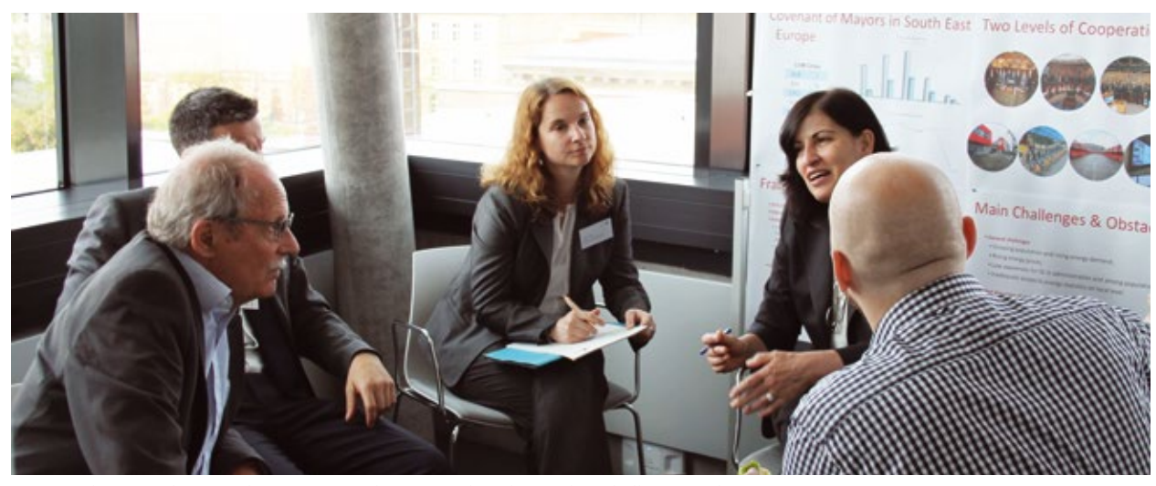
Municipalities, academia and private sector discuss together about urban challenges at the event

One peer group brainstormed ideas regarding the question »Can we offer mobility without traffic?«. Ideas included: