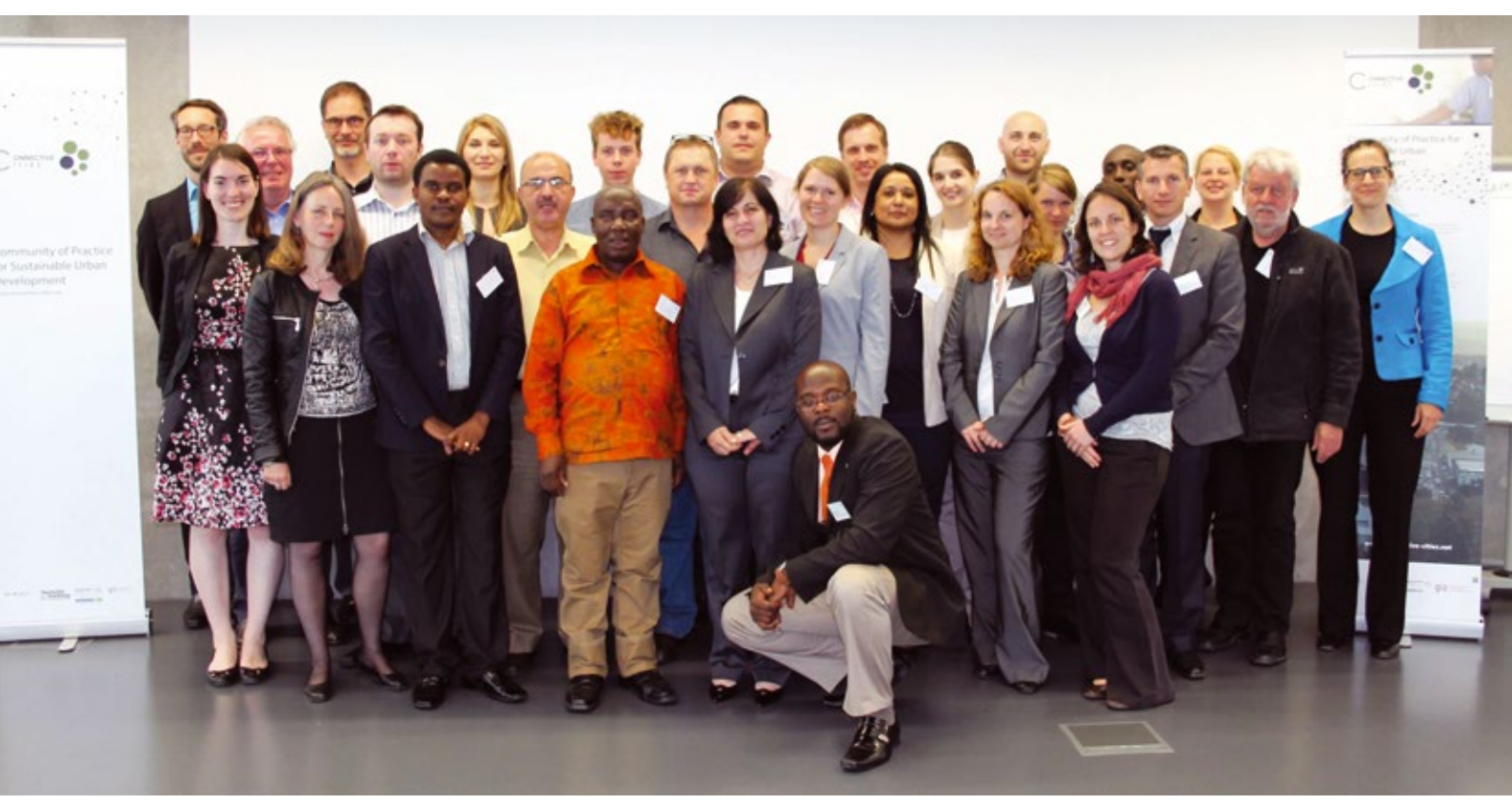
The participants of the Connective Cities dialogue event in Würzburg, Germany