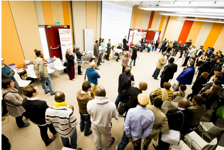
Training and Capacity Building