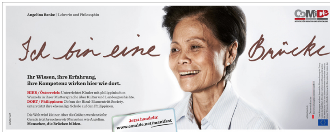
Manifesto and Campaign