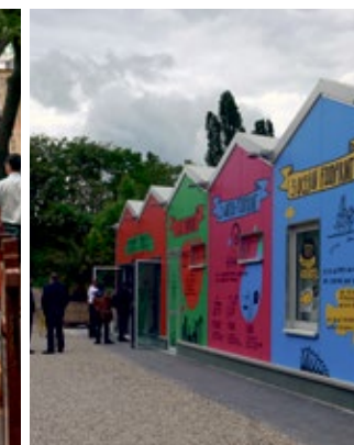
Local economic development