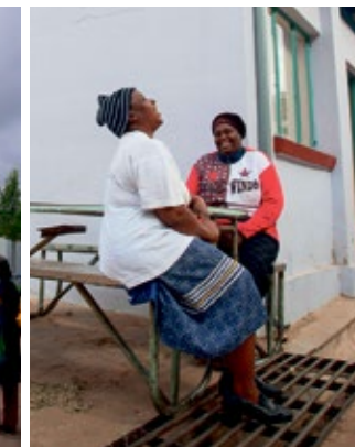
Integrated urban development