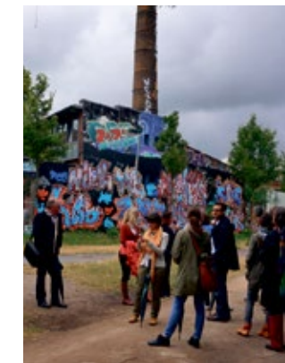
Good urban governance