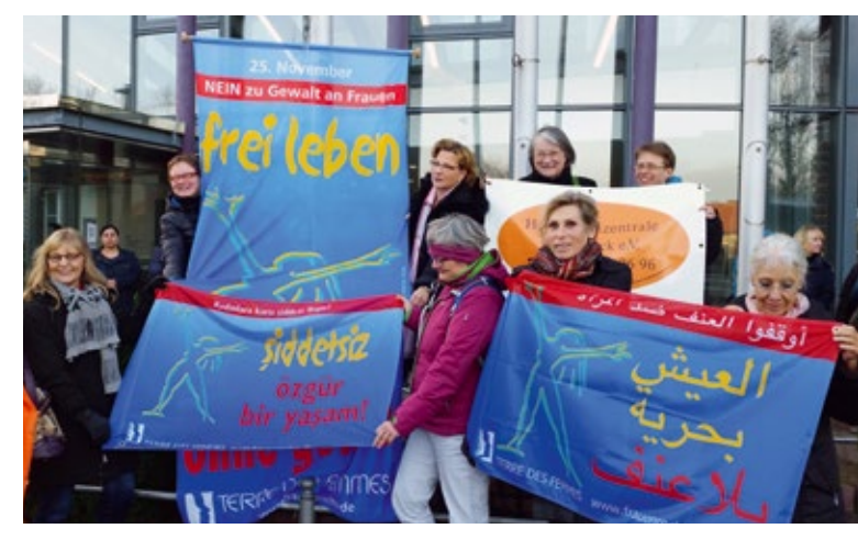
Campaign in Osnabrück to mark the International Day to End Violence Against Women on 25 November