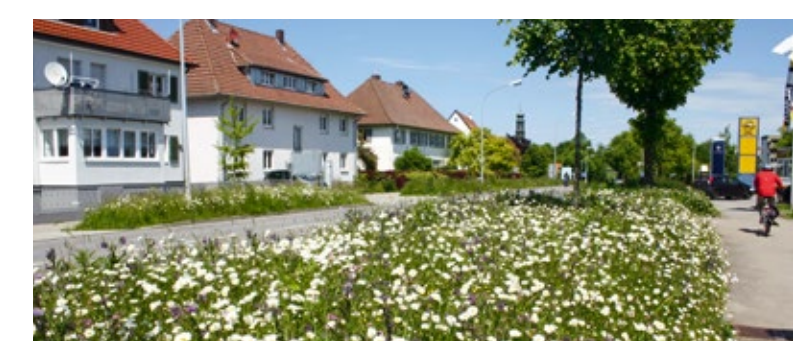
Species diversity instead of uniform green – flowers blooming along the roadside in Bad Saulgau

In Bad Saulgau the sustainability team that work with environmental officer Thomas Lehenherr and senior municipal gardener Jens Wehner get all sorts of individual activities up and running. Yet they all pursue the same overarching objective of local biological diversity. Examples include the