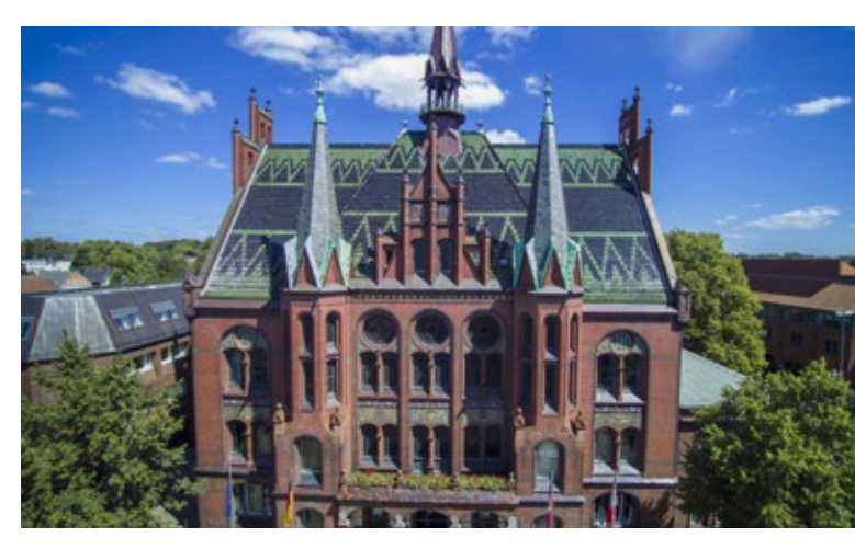
In Neumünster urban development planning is supported by an Integrated Urban Development Master Plan.

Five overarching objectives were defined: maintain and strengthen Neumünster as a regional centre; stabilise the population or increase it to between 80,000 and 90,000; take various sections of the population and their special needs into account; develop unique selling points and a specific profile, and make the town (centre) more attractive.