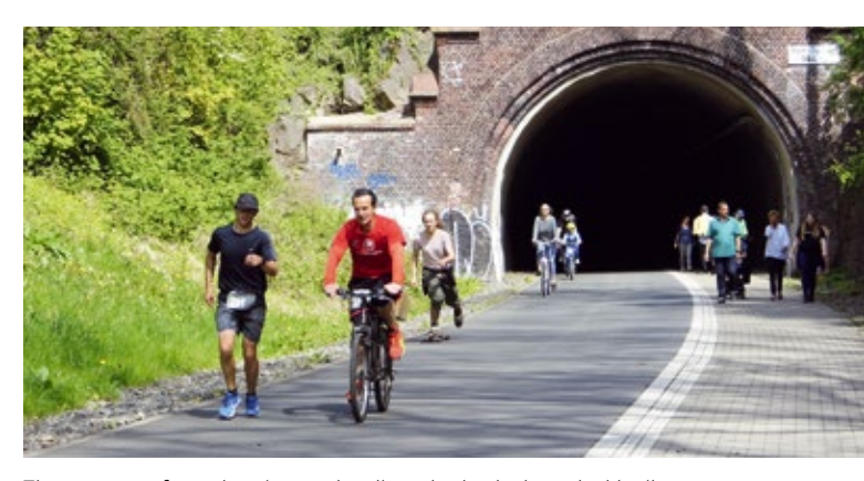
The new route for pedestrians and cyclists also leads through old railway tunnels such as the Rotter Tunnel.

Carsten Gerhardt, First Chair of the association, says that initially there was no support from the municipality. 'We had to fight for years', he says. Campaigns to get people involved revealed that citizens were very interested. They cleared wood from around the line and cleaned up more than 70,000 square metres of land that could be used. In 2007 a first section of the cycle path about 100 metres long was unveiled for demonstration purposes.