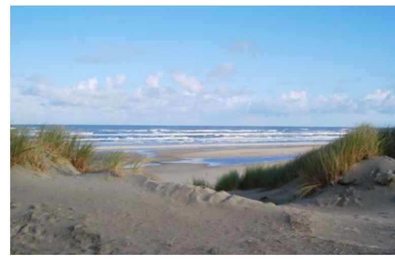
The island of Juist is fighting plastic waste in order to protect the sea and the coastal region.

And it's not just a matter of a few old fishing nets. 'It's no joke when you see all the things that get washed up on the beach', says Thomas Vodde. As he explains, this includes absolutely everything – from small plastic items to TV sets and even fridges. In 2013, a total of 4.6 tons of waste had been accumulated by the time the pallet cages were emptied. This is another reason why the idea of pallet cages is now also being adopted on the other East Frisian islands. Juist's environmental protection and climate action programme includes further measures designed to make the island more plastic-free. A procurement regulation ensures that the municipality avoids plastic when procuring goods.