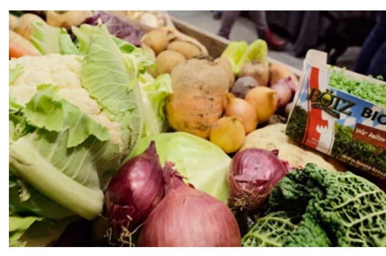
The production of organic foods is being continuously expanded in the Nuremberg Metropolitan Region.

Step by step, the process was driven forward. Municipalities have developed their own regulations in hospital canteens, and for caterers in schools and child day-care centres, for instance regarding the percentage of regional and even organic products used.