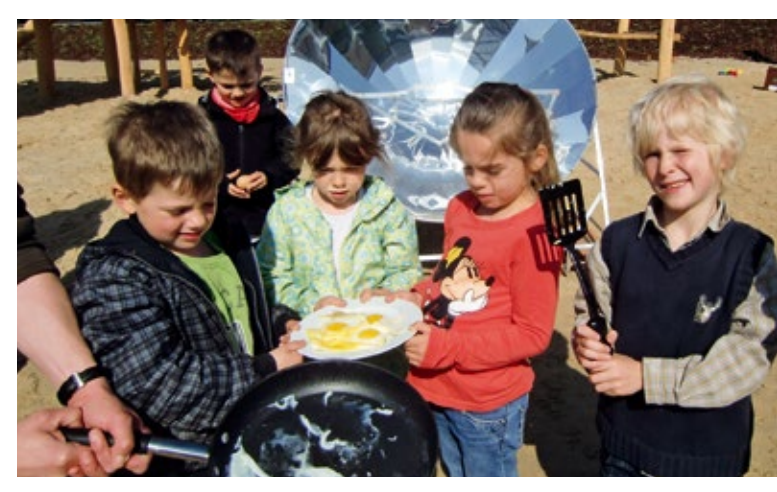
Cooking with solar power – in Alheim, the youngest learn a great deal about sustainability.

Yet sustainability is more than just green energy. How does organic farming work? How is bread baked? In out-of-school