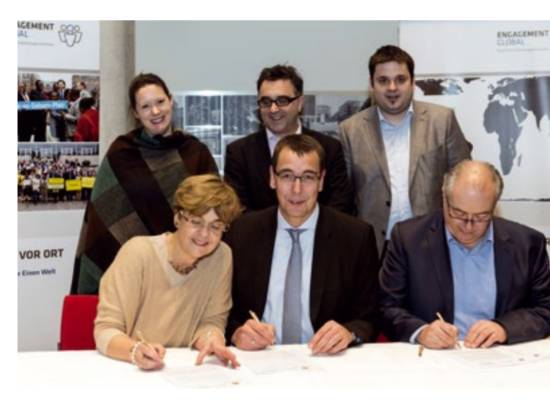
Signing up to the Leipzig-Travnik partnership for sustainability

In 2016 the two municipalities decided to take part in the Service Agency's pilot project 'Municipal Partnerships for