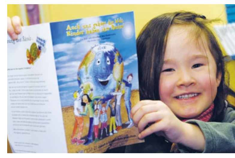
The City of Gelsenkirchen intends to create equal opportunities for all children.

Following a council resolution, in 2016 the city signed the specimen resolution 'The 2030 Agenda for Sustainable Development: Building Sustainability at the Local Level', drafted by the Association of German Cities and the Council of European Municipalities and Regions. By doing so the city committed to implementing the UN Sustainable Development Goals (SDGs). Here it will be able to build