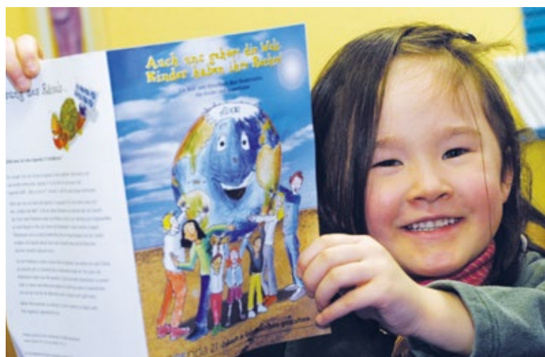
The City of Gelsenkirchen intends to create equal opportunities for all children.

Following a council resolution, in 2016 the city signed the specimen resolution ‘The 2030 Agenda for Sustainable Development: Building Sustainability at the Local Level’, drafted by the Association of German Cities and the Council of European Municipalities and Regions. By doing so the city committed to implementing the UN Sustainable Development Goals (SDGs). Here it will be able to build