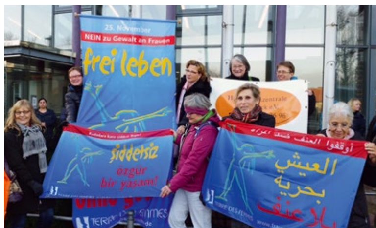
Campaign in Osnabrück to mark the International Day to End Violence Against Women on 25 November