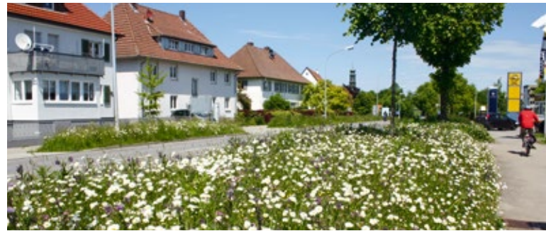
Species diversity instead of uniform green – flowers blooming along the roadside in Bad Saulgau

In Bad Saulgau the sustainability team that work with environmental officer Thomas Lehenherr and senior municipal gardener Jens Wehner get all sorts of individual activities up and running. Yet they all pursue the same overarching objective of local biological diversity. Examples include the