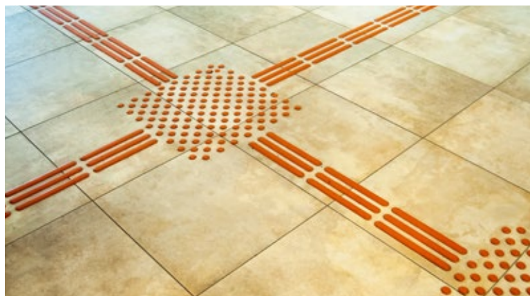
At the town hall a tactile guidance system leads people to their destination.