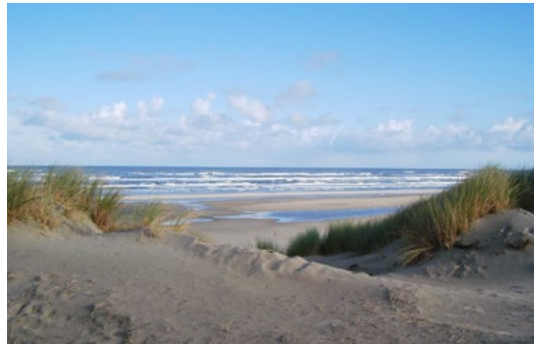
The island of Juist is fighting plastic waste in order to protect the sea and the coastal region.

And it's not just a matter of a few old fishing nets. 'It's no joke when you see all the things that get washed up on the beach', says Thomas Vodde. As he explains, this includes absolutely everything – from small plastic items to TV sets and even fridges. In 2013, a total of 4.6 tons of waste had been accumulated by the time the pallet cages were emptied. This is another reason why the idea of pallet cages is now also being adopted on the other East Frisian islands. Juist's environmental protection and climate action programme includes further measures designed to make the island more plastic-free. A procurement regulation ensures that the municipality avoids plastic when procuring goods.