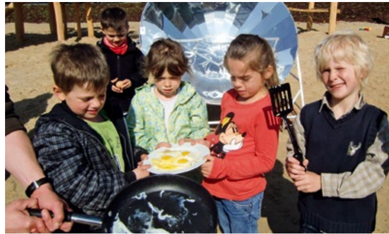
Cooking with solar power – in Alheim, the youngest learn a great deal about sustainability.

Yet sustainability is more than just green energy. How does organic farming work? How is bread baked? In out-of-school