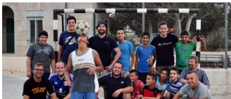
Footballers in Jena's fan project with their partners in Beit Jala

The fact that they have succeeded in doing so is demonstrated by the many visits in both directions and the joint projects between Jena and Beit Jala. Ties emerged for instance with a rehabilitation network and with a women's cooperative in Beit Jala, whose works have since enriched the Christmas market in Jena. Meetings take place between theatre groups and circus projects in Jena and Beit Jala, and there are church