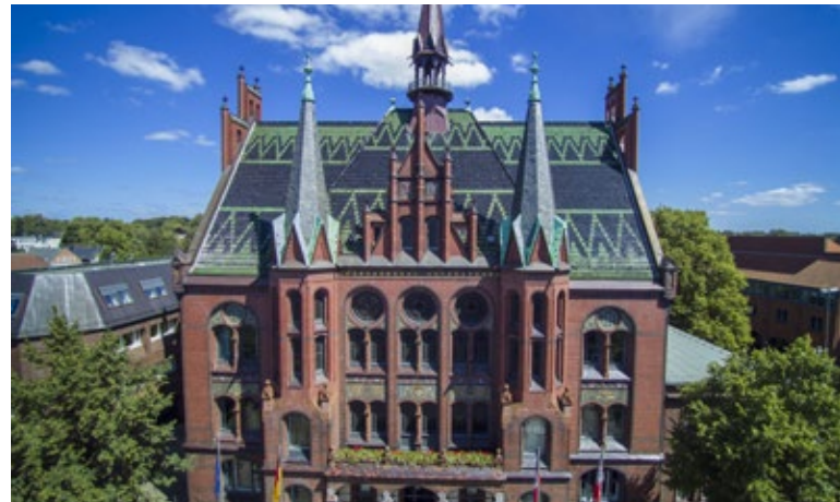
In Neumünster urban development planning is supported by an Integrated Urban Development Master Plan.

Five overarching objectives were defined: maintain and strengthen Neumünster as a regional centre; stabilise the population or increase it to between 80,000 and 90,000; take various sections of the population and their special needs into account; develop unique selling points and a specific profile, and make the town (centre) more attractive.