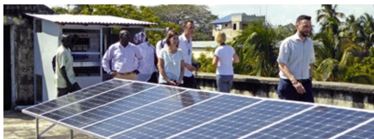
Solar panels in Zanzibar – this African city has a climate partnership with Potsdam.

Alongside the infrastructure projects there are also a number of programmes designed to create awareness of climate change. For instance there is a partnership between the primary schools in Potsdam and in Zanzibar City. Environmental teams have been formed at the two schools, and the children write letters to each other to find out what everyday