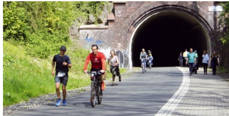
The new route for pedestrians and cyclists also leads through old railway tunnels such as the Rotter Tunnel.

Carsten Gerhardt, First Chair of the association, says that initially there was no support from the municipality. 'We had to fight for years', he says. Campaigns to get people involved revealed that citizens were very interested. They cleared wood from around the line and cleaned up more than 70,000 square metres of land that could be used. In 2007 a first section of the cycle path about 100 metres long was unveiled for demonstration purposes.