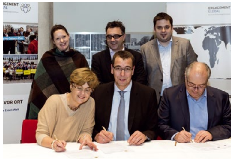
Signing up to the Leipzig-Travnik partnership for sustainability

In 2016 the two municipalities decided to take part in the Service Agency's pilot project 'Municipal Partnerships for