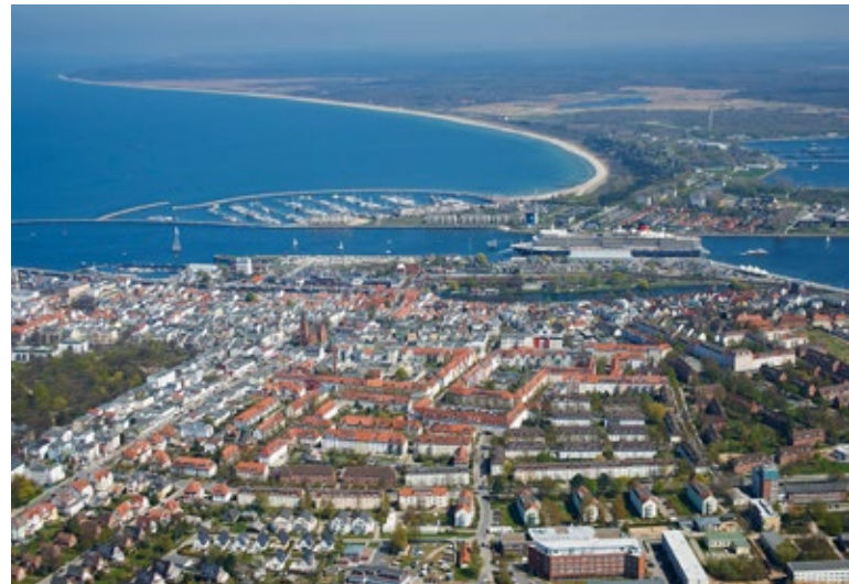
The City of Rostock attaches high priority to fair trade products.

In the Fair Trade Towns campaign the city meets five criteria which demonstrate that engagement for fair trade is firmly established in the municipality. One criterion is that retailers