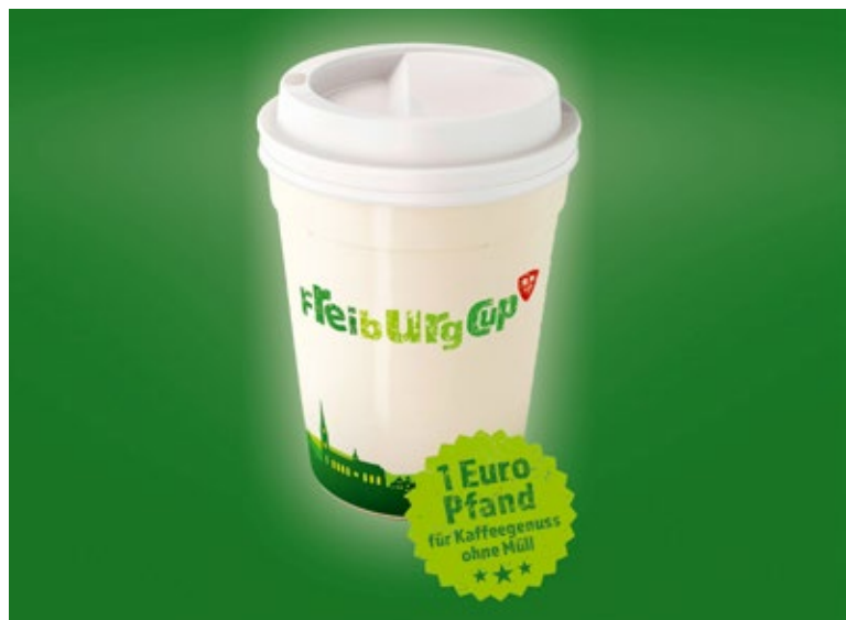
In Freiburg a returnable cup for coffee to go is designed to help prevent waste.