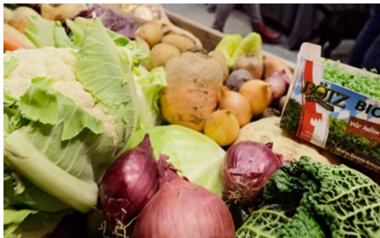
The production of organic foods is being continuously expanded in the Nuremberg Metropolitan Region.

Step by step, the process was driven forward. Municipalities have developed their own regulations in hospital canteens, and for caterers in schools and child day-care centres, for instance regarding the percentage of regional and even organic products used.