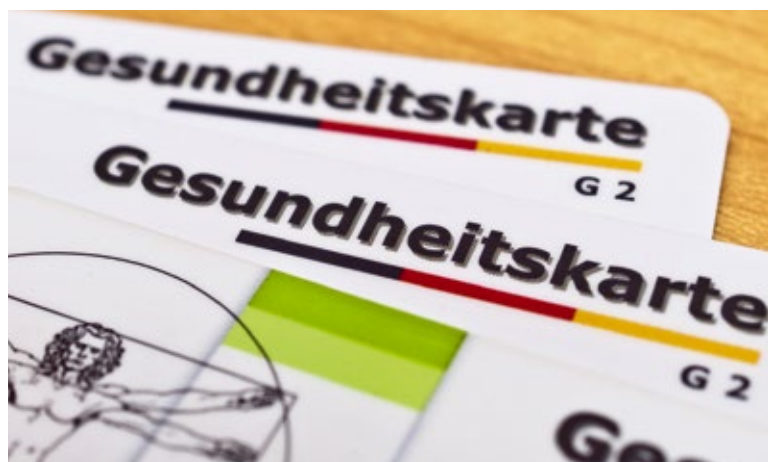
Asylum seekers in Bremen have been receiving health insurance cards for over ten years.