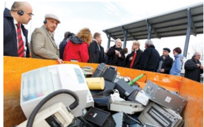
Visiting the recycling yard

The Jena Municipal Services (ksj) company was established in 2002, and today employs a workforce of some 300. Owned by the city, this is the company responsible among other things for solid waste management, and road and pavement cleaning. It also provides numerous other services (including commercial services) involving solid waste management and disposal, including its container service and the disposal of all types of waste from industrial enterprises.