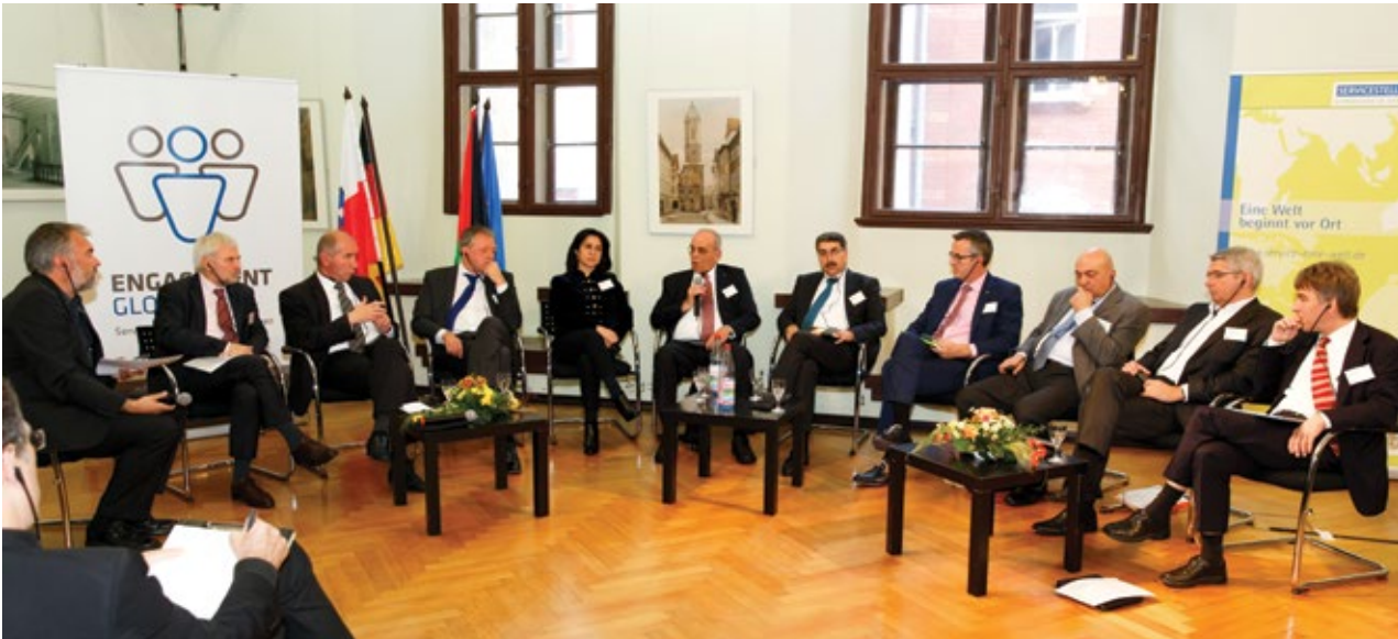
The mayors' forum