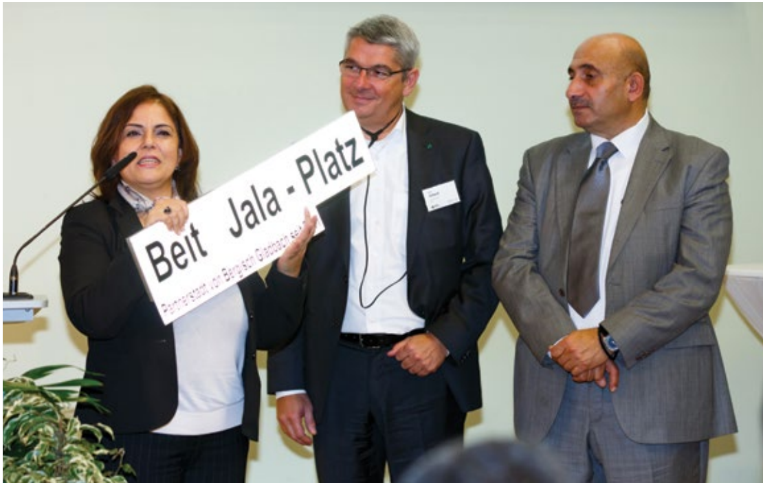
In September 2015, Beit Jala Square was inaugurated in Bergisch Gladbach. The ambassador attended, and the town presented a street sign as a memento of the moment.