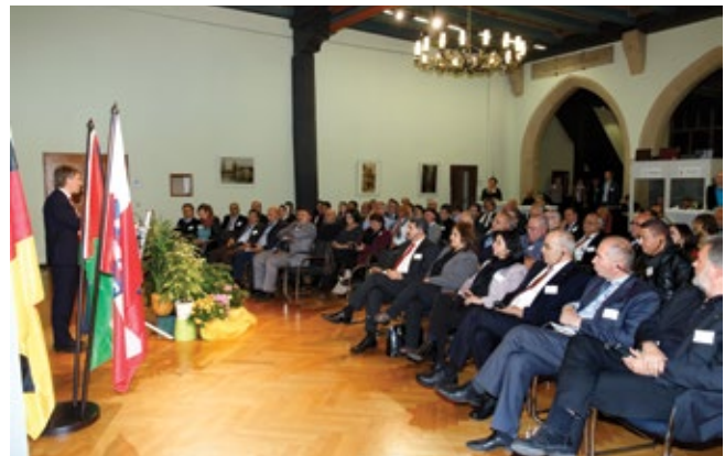
Welcome address at the town hall

enter into a partnership with a Palestinian municipality. This is about sharing, this is where people meet – and do so in front of the wall and not behind it.