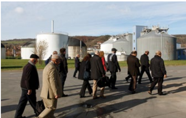
Touring the sewage treatment plant

The Head of the Sanitation Department and Director of the Jena Water Company then presented the company and Jena's central sewage treatment plant. The plant has been operating since 1976, and treats the domestic and industrial wastewater of the city of Jena and several neighbouring municipalities.