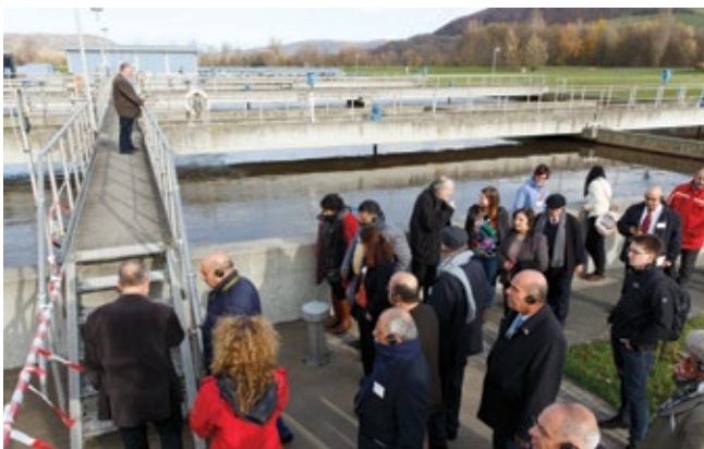
Participants inspecting the clarification tanks

Participants then toured the compound of the treatment plants following the path taken by the wastewater: from the mixed water sewer, via the computing systems and on to the mechanical and biological treatment processes in the various clarification tanks.