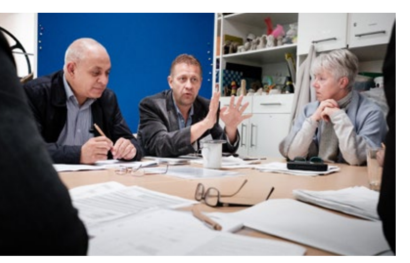
Beit Jala and Bergisch Gladbach are pioneering the transformation to LED street lighting in Palestinian municipalities.

Energy efficiency, particularly LED lighting, is a key topic in some of the German-Palestinian municipal partnership projects. This working group focused on administrative and technical processes and discussed the lessons learned from the cooperation between Bergisch Gladbach and Beit Jala in this field.