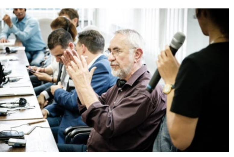
Set on formulating project ideas, Palestinians and Germans exchange challenges they face on the local level and seek solutions to address them.

Mutual learning, shared learning and developing new ideas for partnership projects were the focus of the conference's three info spaces, which dealt with social participation, sustainability and funding opportunities.