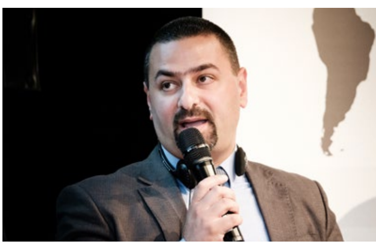
Jehad Kheir, Mayor of Beit Sahour, approves of the cooperation between the Association of Palestinian Local Authorities and Palestinian municipalities.