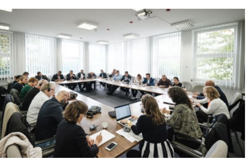
The conference offered a variety of workshops on strategies, tools and effective communication for all sorts of project partnerships.