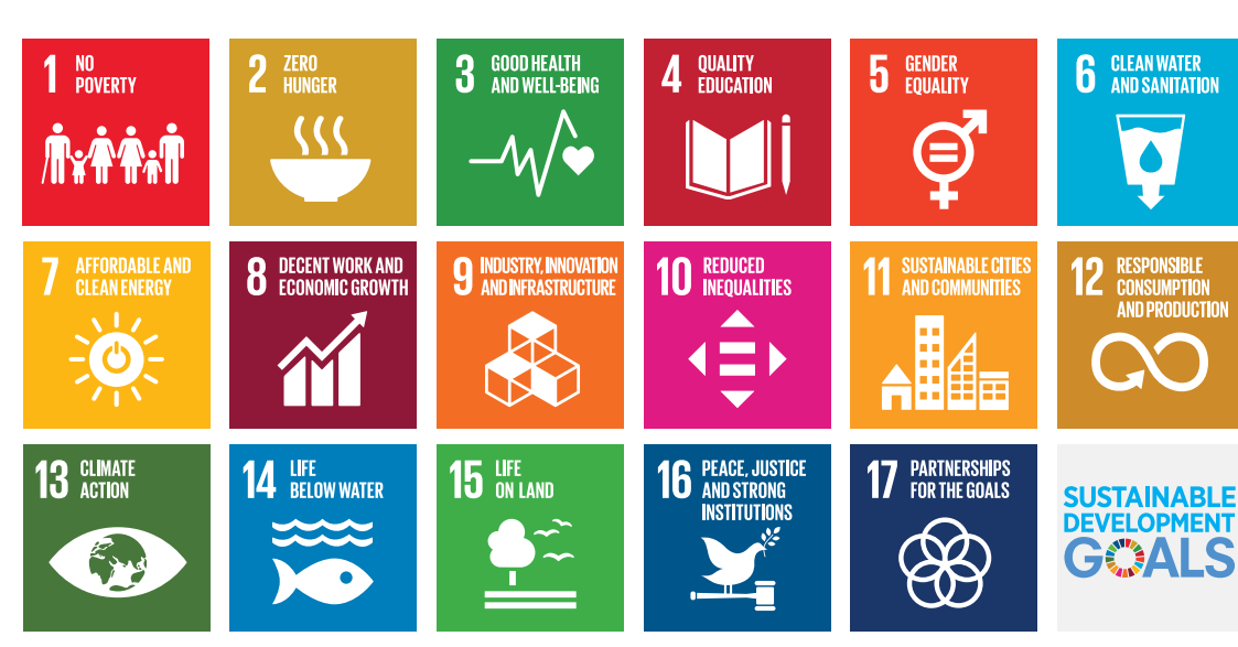
The Sustainable Development Goals (SDGs)

The 2030 Agenda places the Mannheim 2030 Mission Statement in an internationally recognised framework, which means its goals are validated by the international community. This acknowledgement fosters sustainability. The statement was adopted by the city council and is binding until 2030.