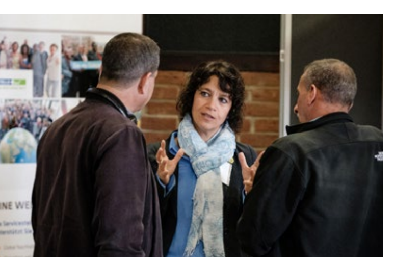
The conference allows for direct exchanges and detailed looks into individual matters.

Every municipal partnership tackles different issues and involves different actors, depending on the specific local situation and needs. This does not mean, however, that they cannot learn from each other. What about involving more civil society stakeholders in partnership activities to establish them on a broader basis? Two partnerships – Neuwied with Surrif, and the cities of Bethlehem Governorate with their various German partners – shared their experiences with the conference participants.